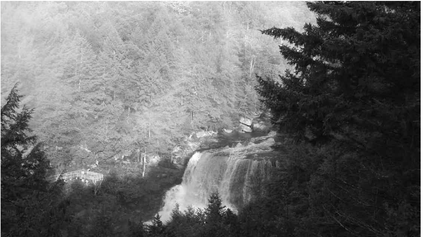
BLACKWATER FALLS, TUCKER COUNTY, WV